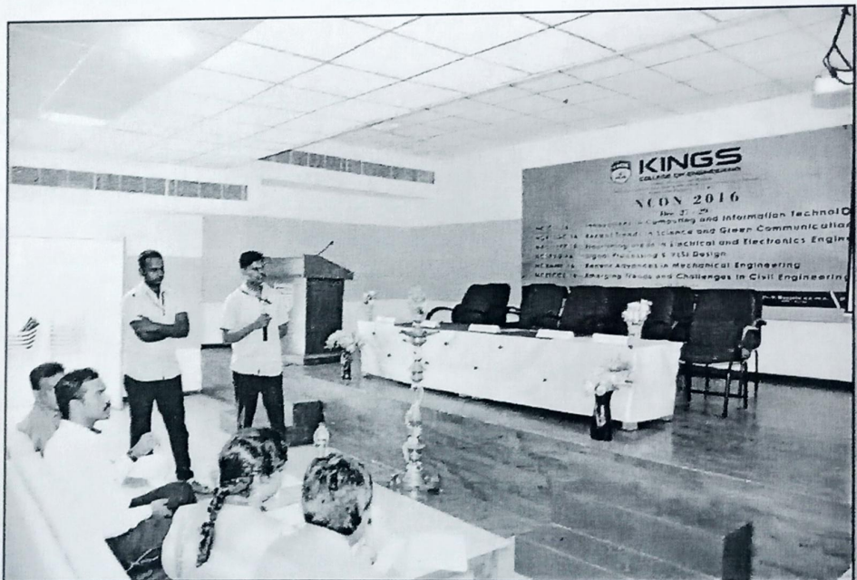
A Technical Paper Being Presented.