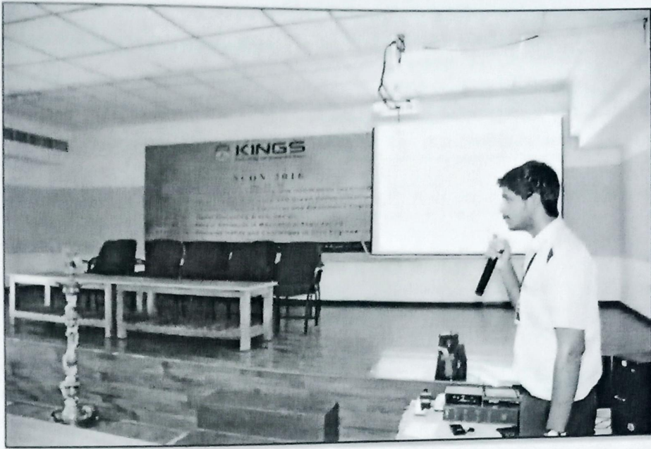
A Technical Paper Being Presented

In the afternoon, the second Technical session started and 15 papers were presented during that session.