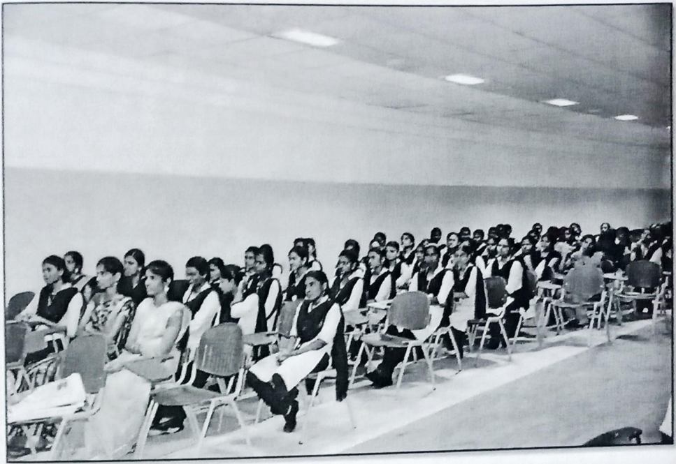
Students examining the Chief Guest lecture