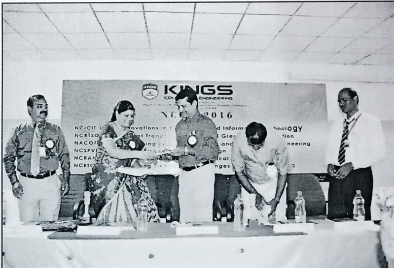
Proceedings was released by Chief Guest and received by Principal.

The conference proceedings was revealed by the chief guest and received by Principal and jointly felicitated all the guests present.