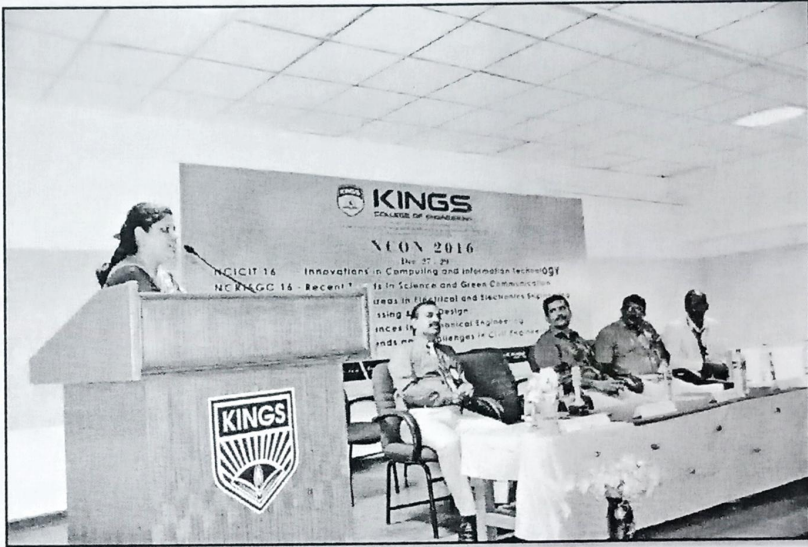
Chief Guest addressing the audience