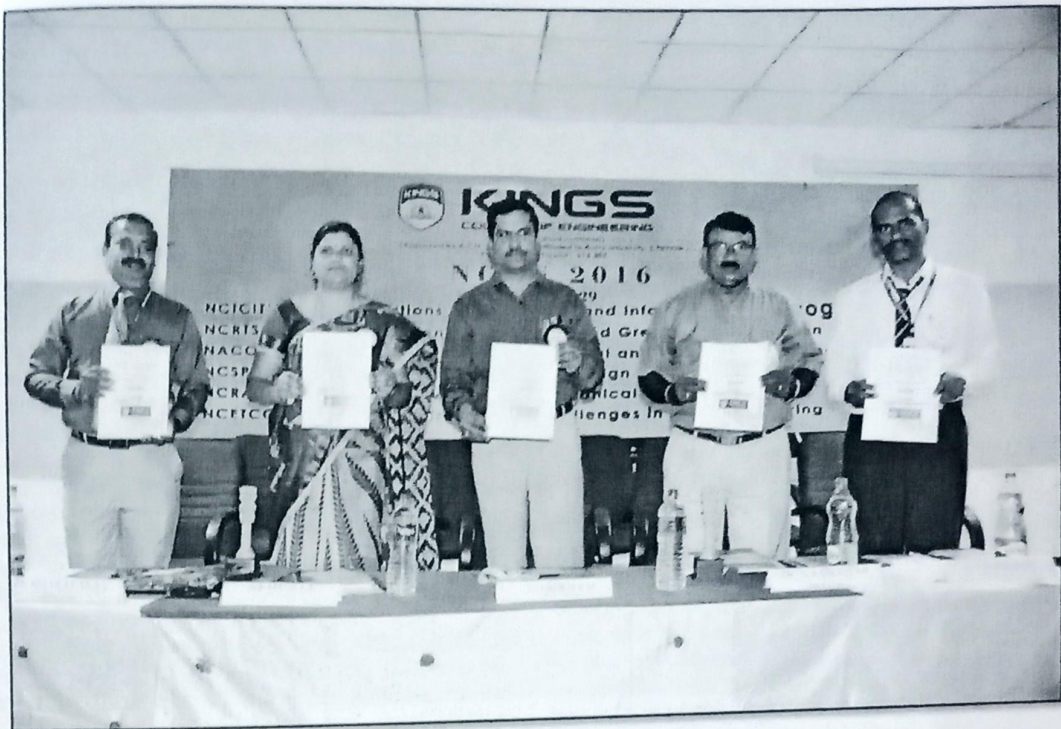
NC-ETCCE'16 Proceedings Release