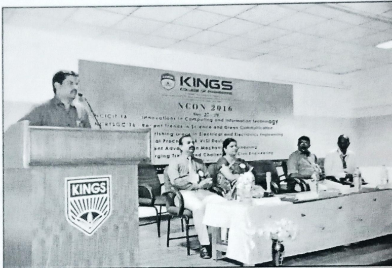
Principal Delivering the Presidential Address.